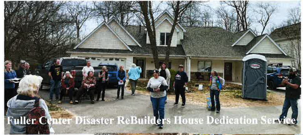
Fuller Center Disaster ReBuilders House Dedication Service