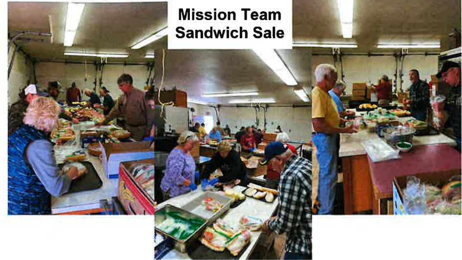
Mission Team Sandwich Sale

Thank you to everyone for your support of this years Mission Team Sandwich Sales. The recent October sale made a profit of $5,100. This will help greatly toward our next trip.