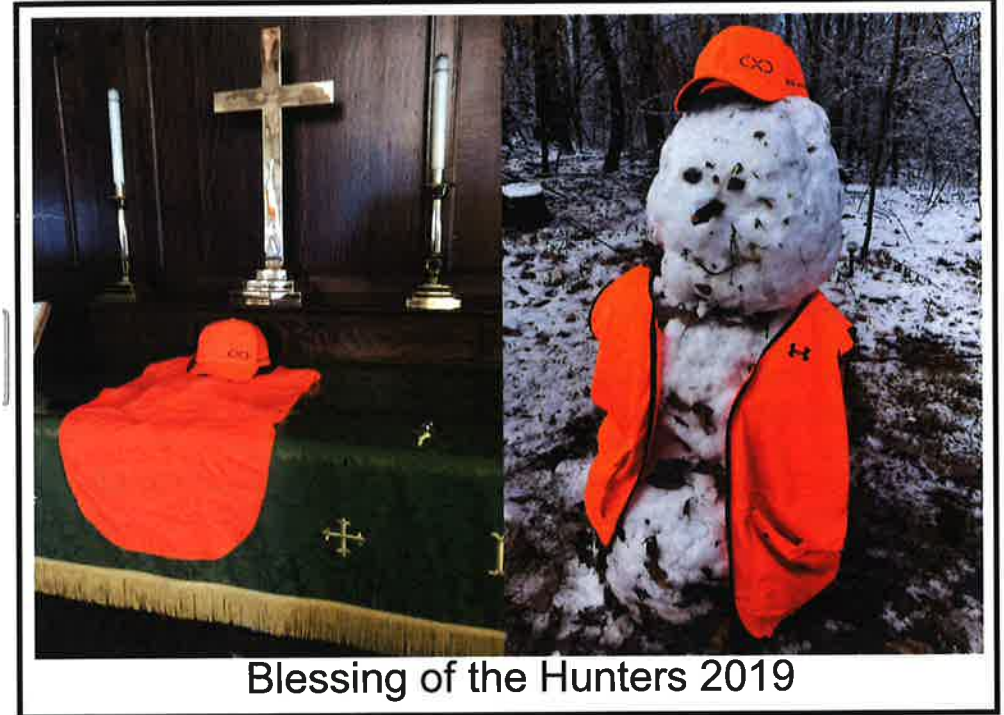
Blessing of the Hunters 2019

Church Office: Mon.-Thurs. 9:00 a.m. to 2:00 p.m. Services every Sunday at 7:45 a.m. & 10:15 a.m.