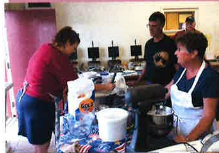
Turkey and Waffle Supper