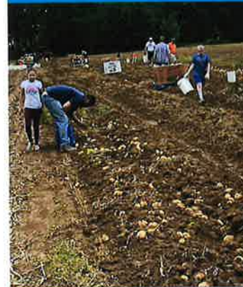
Potato Picking for the Potato Project