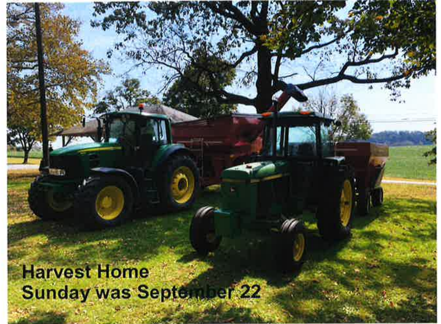
Harvest Home Sunday was September 22

Church Office: Mon.-Thurs. 9:00 a.m. to 2:00 p.m. Services every Sunday at 7:45 a.m. & 10:15 a.m. Sunday School at 9:00 a.m.