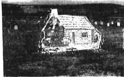
As it appeared in the 1700s

The first church of Salem Belleman's was a log structure built in 1746, presumably on land that was owned or located near the Belleman family. This simple building served both the German, Reformed and Lutheran congregation over the years. In the beginning there were not accurate records kept and the preachers of