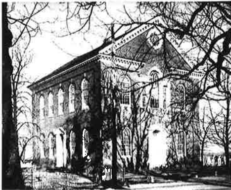
The 1815 Old Belleman's Church