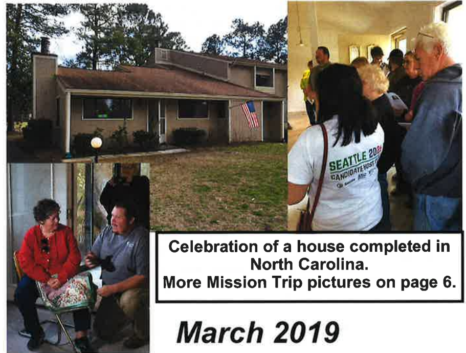
Celebration of a house completed in North Carolina. More Mission Trip pictures on page 6.

Services every Sunday at 7:45 a.m. & 10:15 a.m. Sunday School at 9:00 a.m.