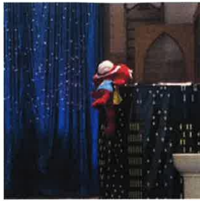
Flash and Belleman led us all out to our missions each evening.